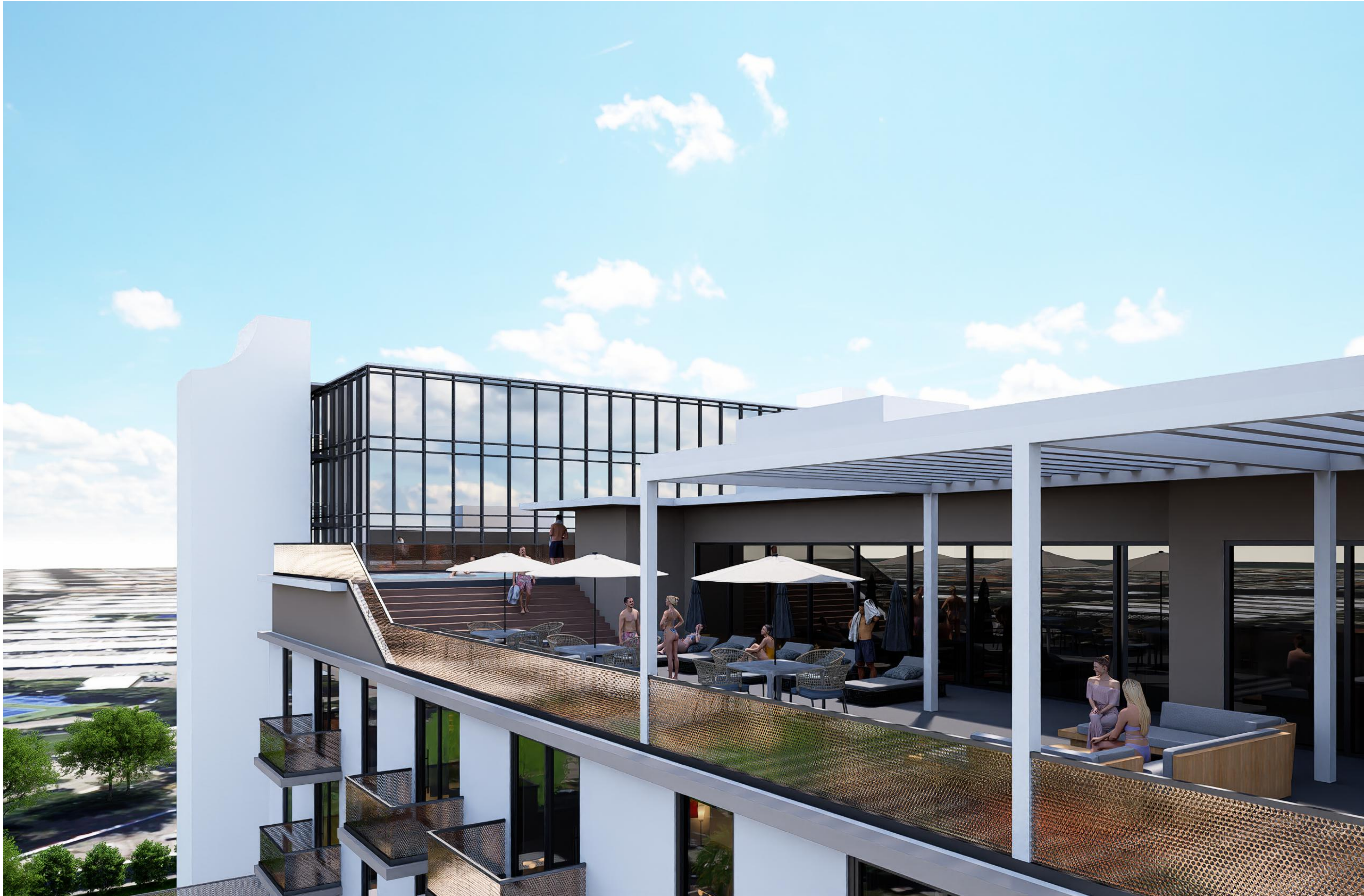
ZOOM-IN VIEW OF THE ROOFTOP TERRACE